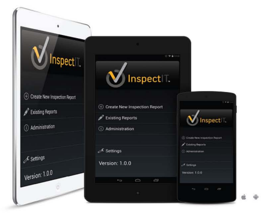
Available For iPad® · Android™

The InspectIT Home Inspection Software is the easiest reporting application on the market today, with a user-interface that is simple to use. InspectIT was designed by industry professionals that understand how this tool will help make your job easier and your business more successful.